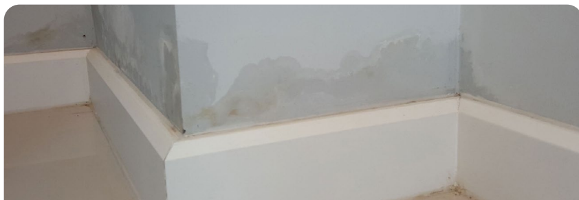
Example of penetrating damp rising up the wall

Damp patches like these could be caused by a few different things such as penetrating damp, leaking pipes, problems with your roof, walls, chimney or drains and sometimes a problem with your damp proof course. If you spot any damp patches like this, get in touch with us straight away so we can send someone out to take a look and sort things out.