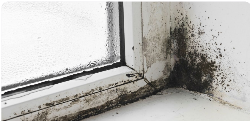
Example of black mould forming around a window frame