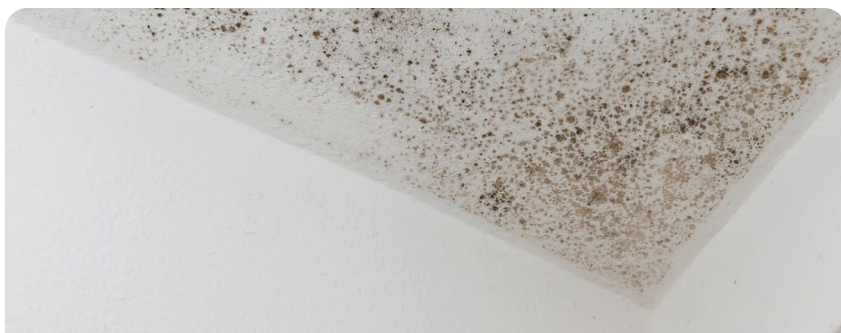
Example of mould caused by loft insulation cold spots

Hint: Warm air holds more moisture than cold air, which in simple terms means that you have reduced humidity levels. Keep your home at a steady temperature throughout winter.